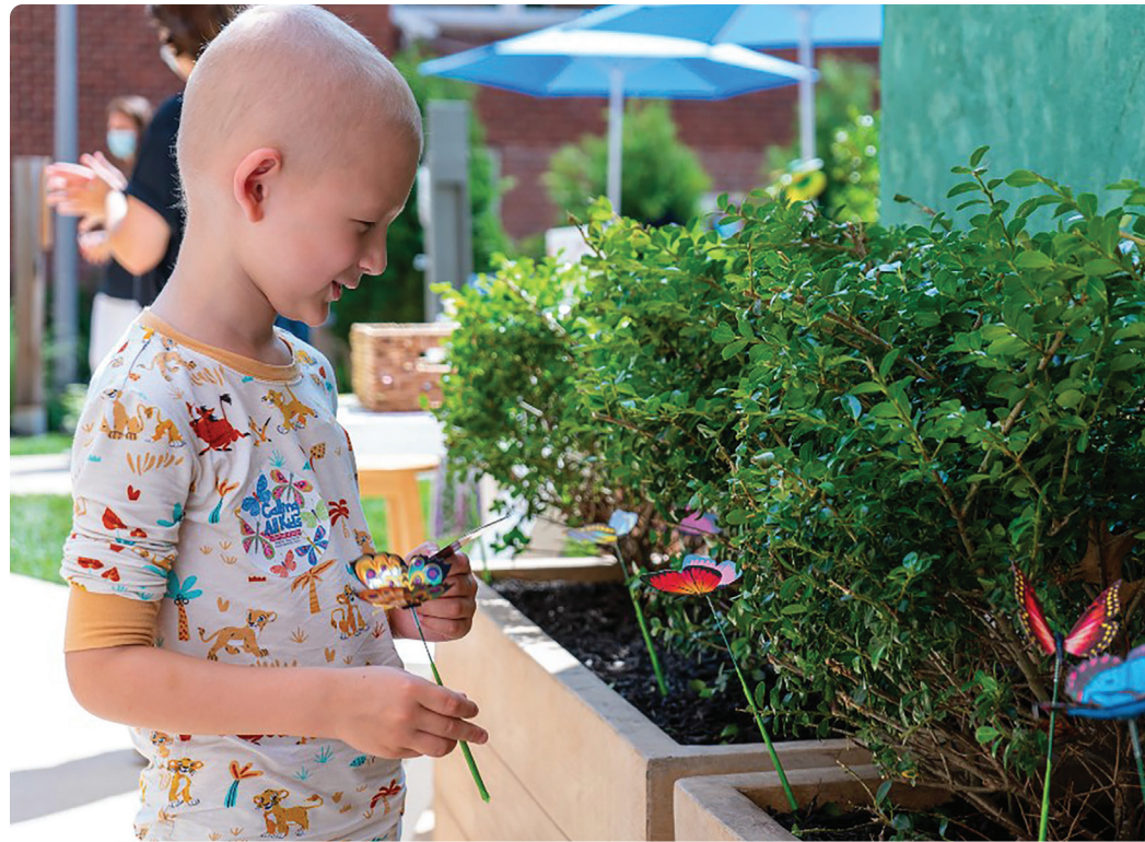
Patient at Goryeb Children's Hospital enjoys Mickey's Garden.